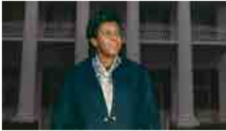
Front Cover & Above: Photo of U.S. Congresswoman Barbara Jordan, Photo of Barbara Jordan in front of the Texas Governor's mansion

Barbara Jordan was indisputably a force to be reckoned with. The lawyer, educator and former U.S. representative's intersectional identity gets dissected in the new Independent Lens documentary The Inquisitor . From the revision of the Voting Rights Act to the 1974 impeachment hearings of President Nixon, Jordan made an impact. Recognized by her peers in both political parties alike for her undeniably exceptional political oratory skills, she was nicknamed "inquisitor." But little did everyone know the battle she quietly fought in secret. Find out more about The Inquisitor on Monday, February 23, at 10pm on KQED 9.