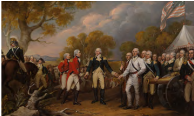
Surrender of General Burgoyne at Saratoga, October 16, 1777, by John Trumbull.

Discover more dramas, nature shows and local programs in your Passport library at kqed.org/passport or by using the PBS App.