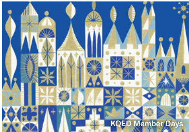
KQED Member Days

Thursday, August 21, 7pm, Standing: $45 + fees, GA - Seating: $60 + fees, VIP: $100 + fees | Suite Treatments, Vallejo