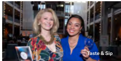
Taste & Sip