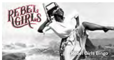
Rebel Girls Bingo