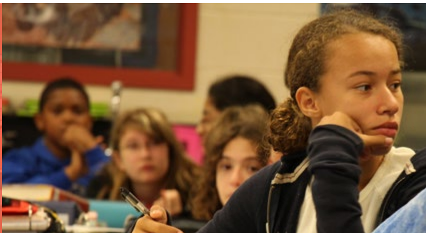
"Listening in science and math" by woodleywonderworks is licensed under CC BY 2.0.