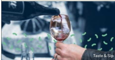
Taste & Sip