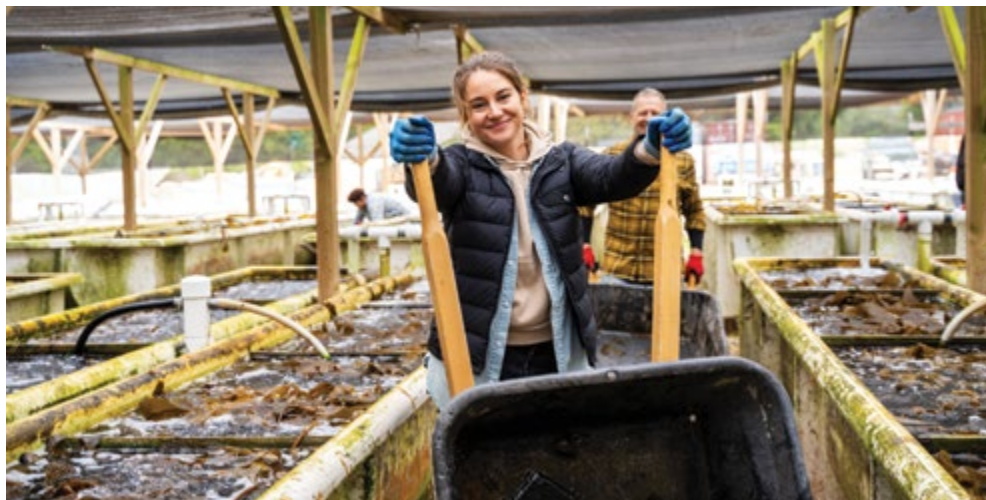
Photo of Shailene Woodley at the Cultured Abalone Farm in Goleta, CA