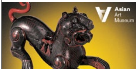
Asian Art Museum