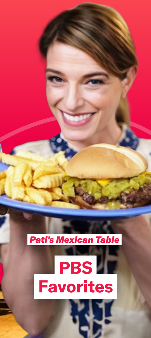
Pati's Mexican Table