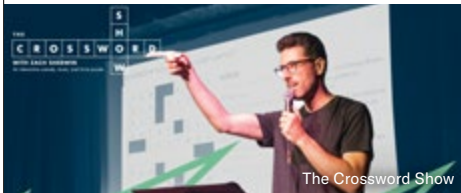
The Crossword Show