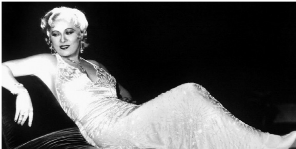
Photo of "Mae West" courtesy of twm1340 and is licensed under CC BY-SA 2.0.