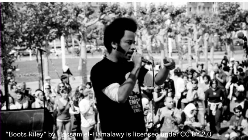
"Boots Riley" by Hossam el-Hamalawy is licensed under CC BY 2.0.