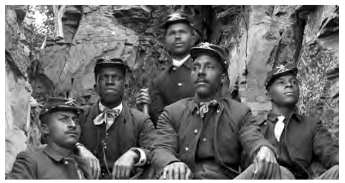
Photo from Buffalo Soldiers: Fighting on Two Fronts: A Local, USA Special. "Group of Soldiers from Fort Missoula courtesy of University of Montana."