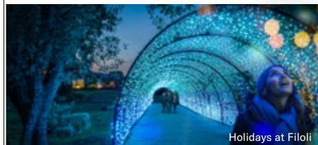
Holidays at Filoli