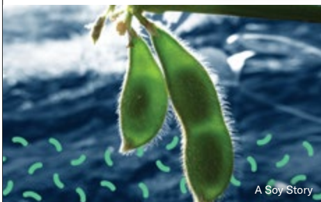
A Soy Story