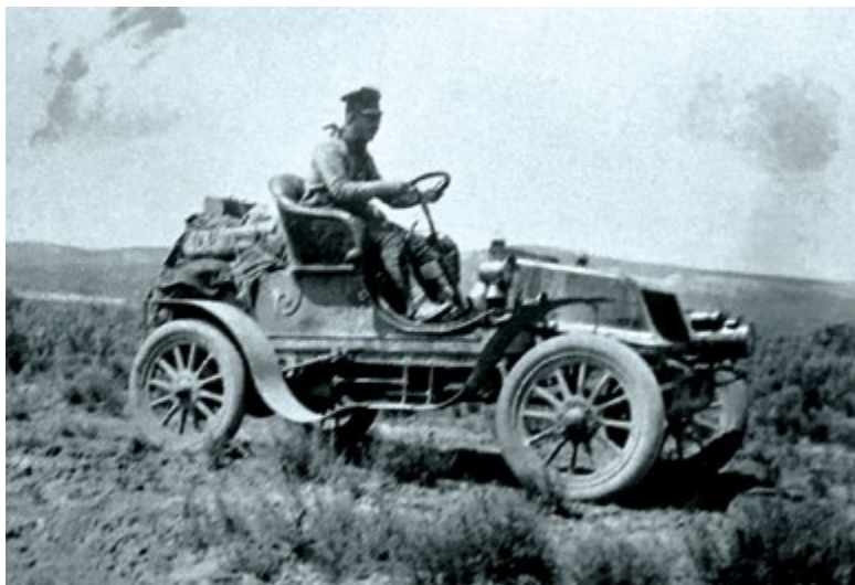
Horatio Jackson Nelson in his Winton car.