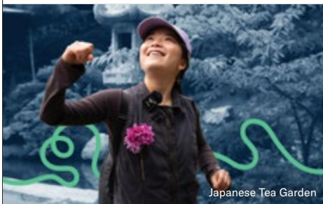
Japanese Tea Garden