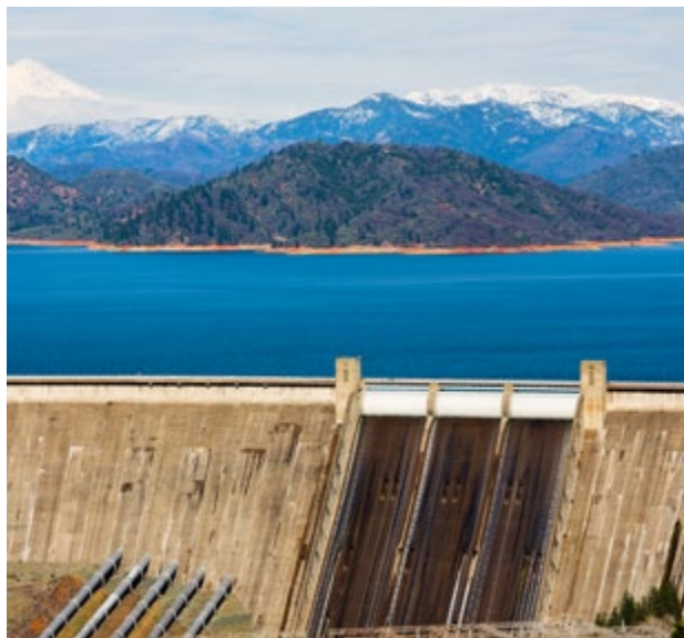
Shasta Dam