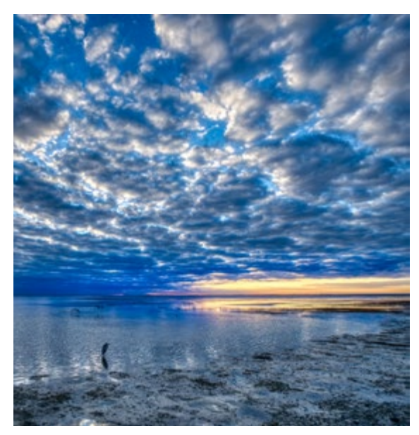
An exposed Tampa Bay grass flat in St. Petersburg, Florida.