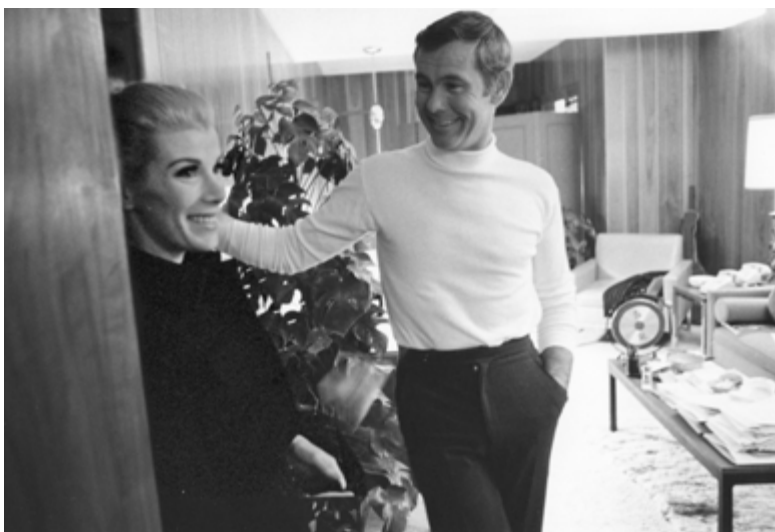
Photo of Johnny Carson and Joan Rivers courtesy of American Public Television.