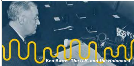
Ken Burns' The U.S. and the Holocaust