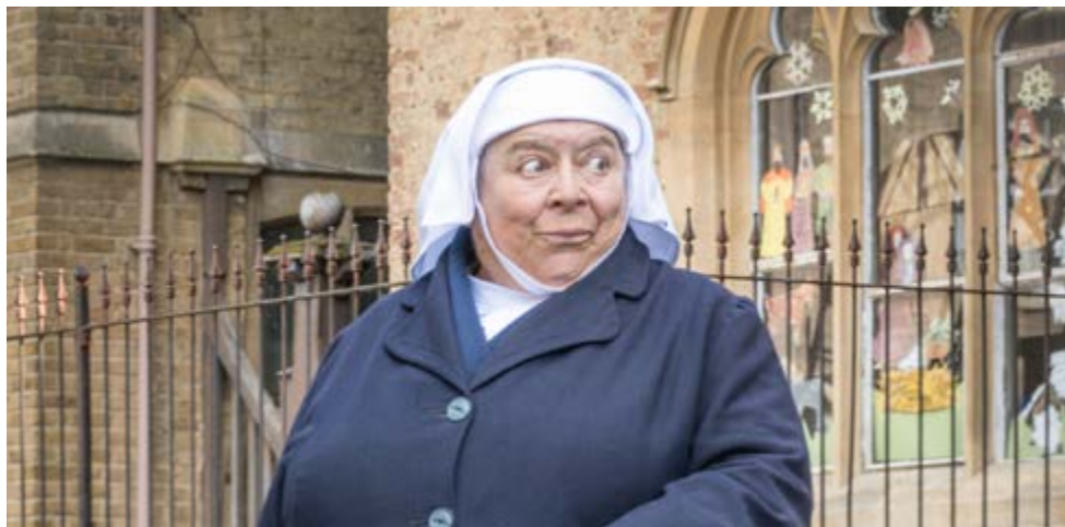
Call the Midwife Holiday Special: Mother Mildred.