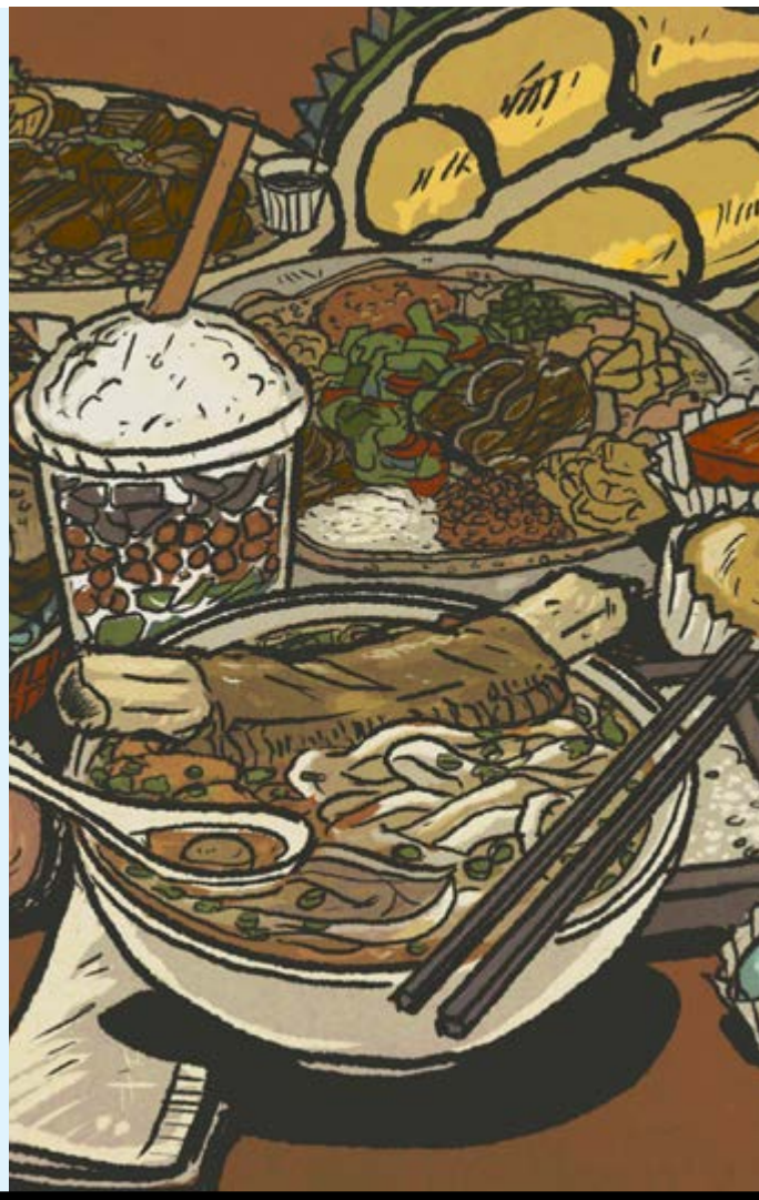
Illustration by Thien Pham.

See what makes San Jose the Bay Area's best immigrant food city in this eight-story series of articles available at kqed.org/sanjosefood .