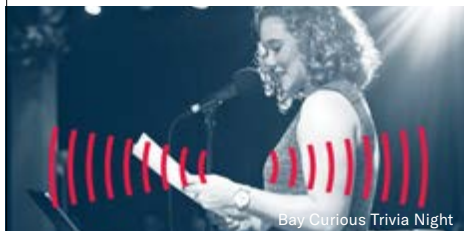
Bay Curious Trivia Night