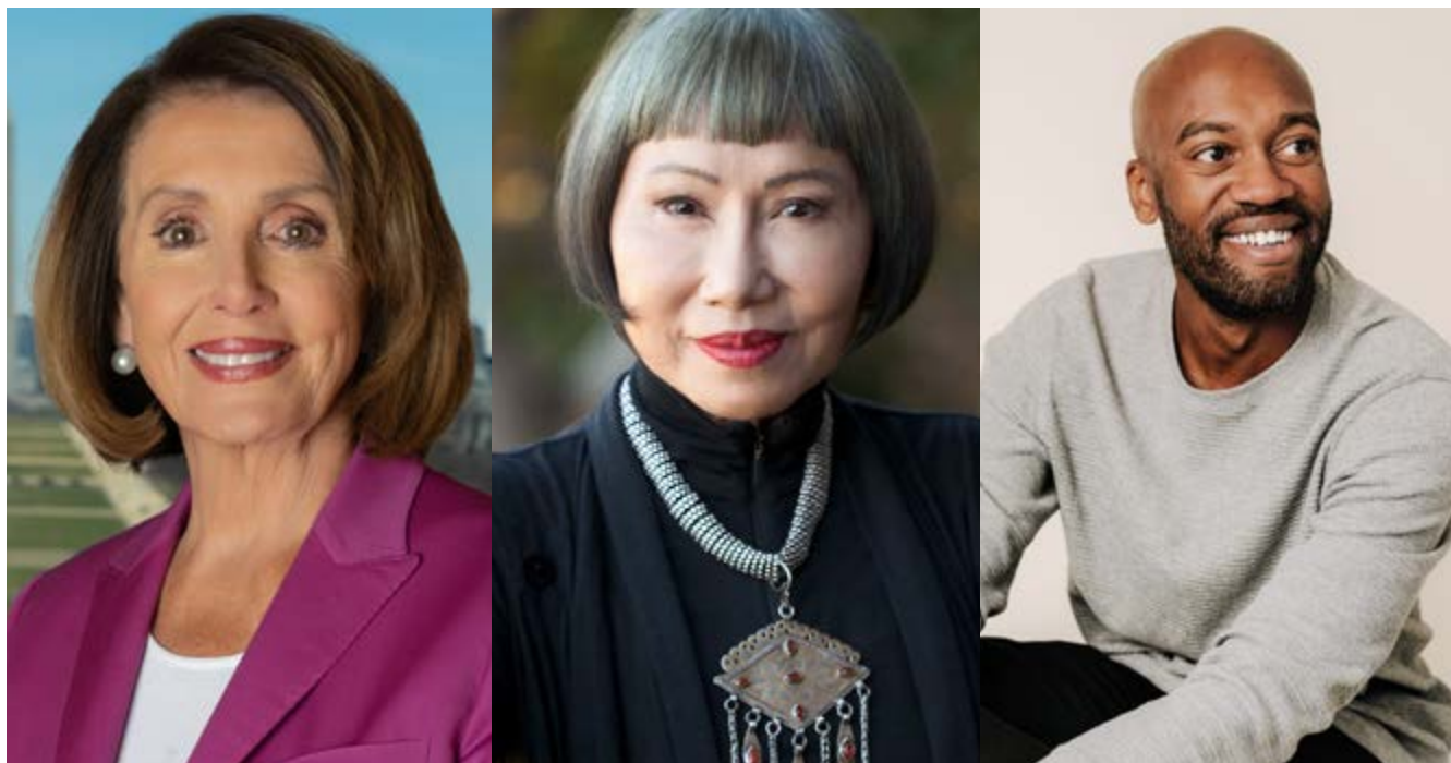
L-R: NANCY PELOSI: AMY TAN: SAM SANDERS