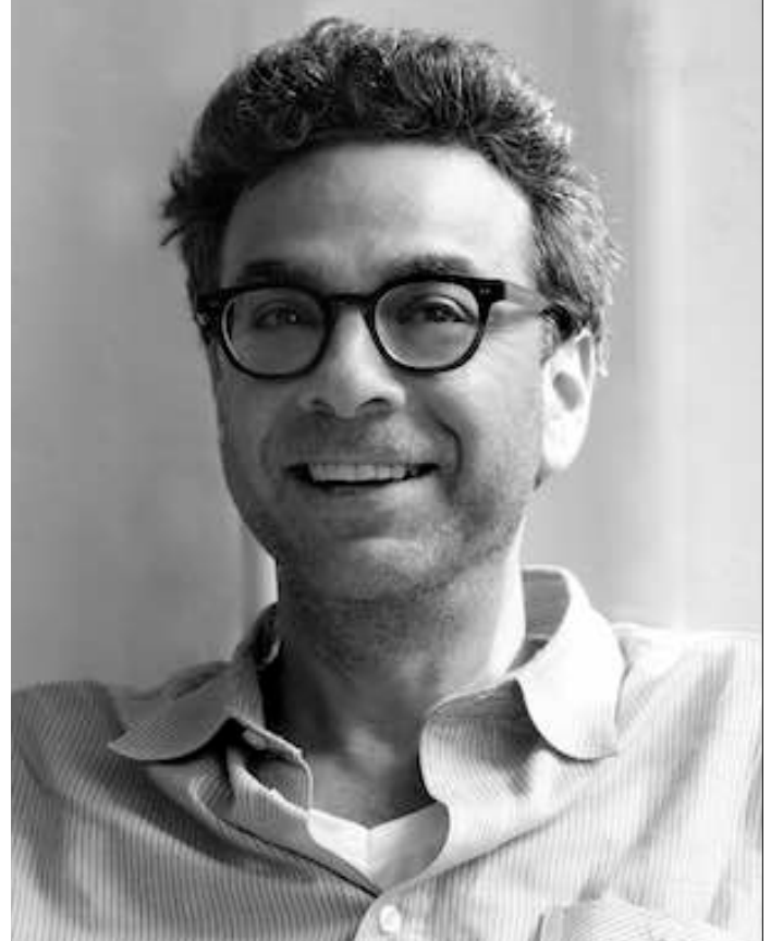
Stephen J. Dubner

Does your name determine your future? Why are people attracted to bad news? What creates happiness? How do you calculate the value of a life? Did any of these questions pique your interest? If yes, don't miss Freakonomics Radio . This fascinating show began as a spinoff of the bestselling 2009 book of the same name written by economist Steven Levitt and journalist Stephen Dubner, who hosts the radio show. The book delved into seemingly random questions that ultimately revealed fascinating insights into human nature and its impacts on society and economics, which the authors argue is actually the "study of incentives." When the book went on to sell millions of copies, Levitt and Dubner decided to continue the conversation in their weekly radio show, investigating even more questions at the intersection of socioeconomics, psychology, philosophy and culture through research and discussion with experts and others. They may not always have the answers, but the show will get you thinking and will challenge you to question what you think you know. Tune in to Freakonomics Radio on Saturdays at 3pm on KQED FM , with a rebroadcast the next morning at 2am.