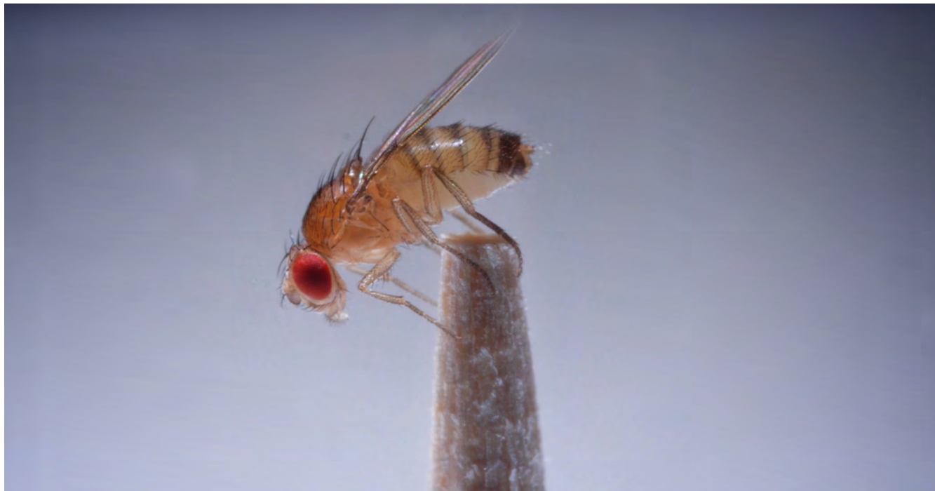
From Deep Look 's This Killer Fungus Turns Flies into Zombies