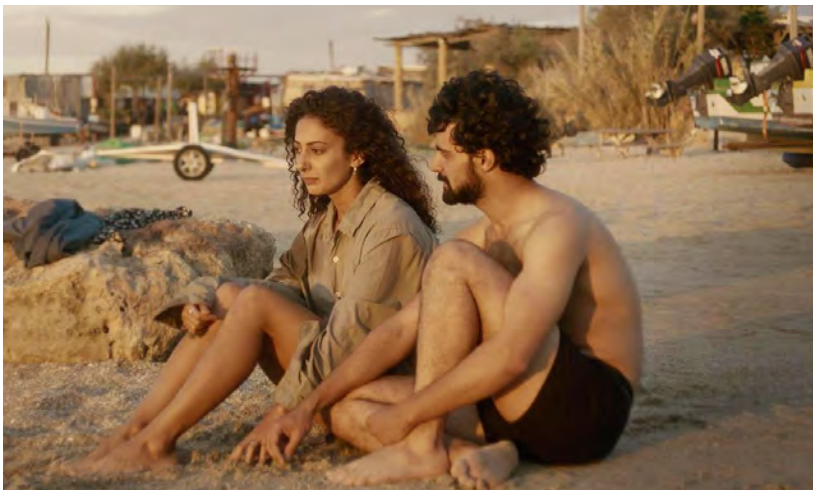
Between Heaven and Earth by Najwa Najjar